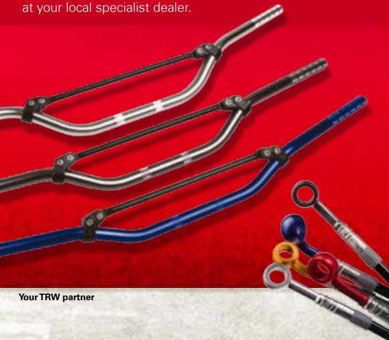
Your TRW partner

Off-road fans can find many more high-quality TRW products at your local specialist dealer.